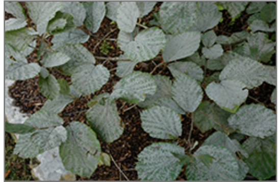
Blue Mist Fothergilla foliage

This shrub does best in full sun to partial shade. It requires an evenly moist well-drained soil for optimal growth, but will die in standing water. It is not particular as to soil type, but has a definite preference for acidic soils, and is subject to chlorosis (yellowing) of the foliage in alkaline soils. It is somewhat tolerant of urban pollution. This is a selection of a native North American species.