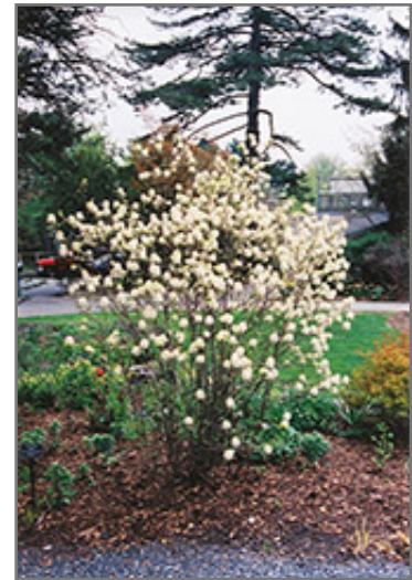
Blue Mist Fothergilla in bloom