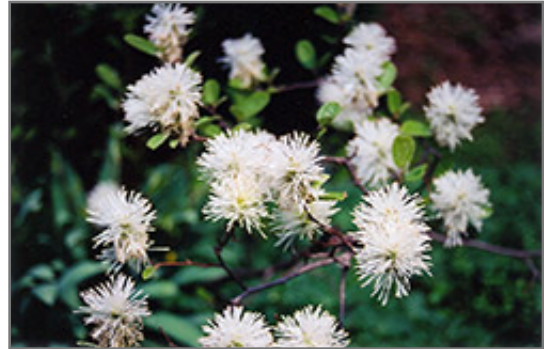
Blue Mist Fothergilla flowers

Blue Mist Fothergilla is recommended for the following landscape applications;