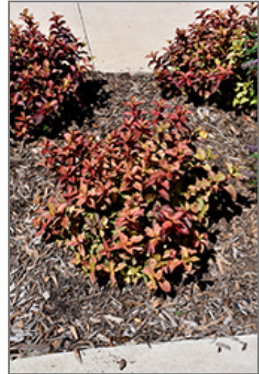
Midnight Sun Reblooming Weigela