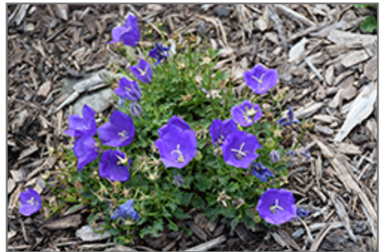
Pearl Deep Blue Bellflower in bloom