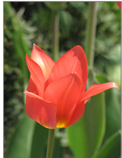
Red Emperor Tulip flowers