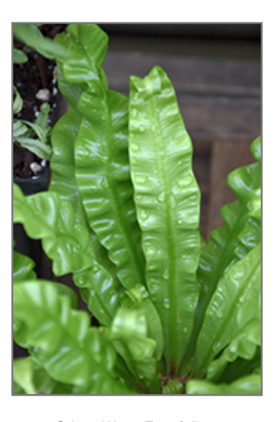
Crispy Wave Fern foliage

When grown indoors, Crispy Wave Fern can be expected to grow to be about 24 inches tall at maturity, with a spread of 18 inches. It grows at a slow rate, and under ideal conditions can be expected to live for approximately 15 years. This houseplant performs well in both bright or indirect sunlight and strong artificial light, and can therefore be situated in almost any well-lit room or location. It does best in average to evenly moist soil, but will not tolerate standing water. The surface of the soil shouldn't be allowed to dry out completely, and so you should expect to water this plant once and possibly even twice each week. Be aware that your particular watering schedule may vary depending on its location in the room, the pot size, plant size and other conditions; if in doubt, ask one of our experts in the store for advice. It is not particular as to soil pH, but grows best in rich soil. Contact the store for specific recommendations on pre-mixed potting soil for this plant.