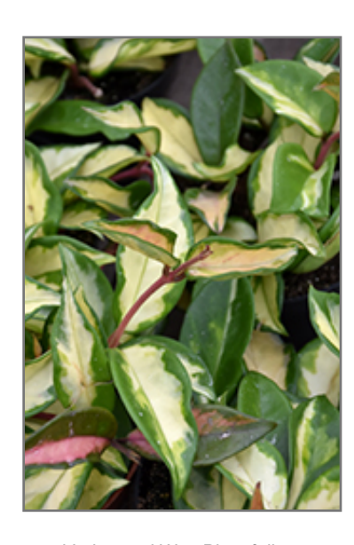
Variegated Wax Plant foliage

When grown indoors, Variegated Wax Plant can be expected to grow to be about 12 inches tall at maturity, with a spread of 5 feet. It grows at a medium rate, and under ideal conditions can be expected to live for approximately 10 years. This houseplant should be situated in a location that that gets indirect sunlight at most, although it will usually require a more brightly-lit environment than what artificial indoor lighting alone can provide. It is very adaptable to both dry and moist soil, but will not tolerate any standing water. The surface of the soil shouldn't be allowed to dry out completely, and so you should expect to water this plant once and possibly even twice each week. Be aware that your particular watering schedule may vary depending on its location in the room, the pot size, plant size and other conditions; if in doubt, ask one of our experts in the store for advice. It is not particular as to soil pH, but grows best in rich soil. Contact the store for specific recommendations on pre-mixed potting soil for this plant.