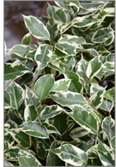
Starlight Weeping Fig foliage

When grown indoors, Starlight Weeping Fig can be expected to grow to be about 5 feet tall at maturity, with a spread of 3 feet. It grows at a medium rate, and under ideal conditions can be expected to live for approximately 50 years. This houseplant will do well in a location that gets either direct or indirect sunlight, although it will usually require a more brightly-lit environment than what artificial indoor lighting alone can provide. It does best in average to evenly moist soil, but will not tolerate standing water. The surface of the soil shouldn't be allowed to dry out completely, and so you should expect to water this plant once and possibly even twice each week. Be aware that your particular watering schedule may vary depending on its location in the room, the pot size, plant size and other conditions; if in doubt, ask one of our experts in the store for advice. It is not particular as to soil type or pH; an average potting soil should work just fine. Be warned that parts of this plant are known to be toxic to humans and animals, so special care should be exercised if growing it around children and pets.