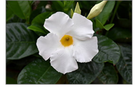
White Mandevilla flowers

This plant does best in full sun to partial shade. It requires an evenly moist well-drained soil for optimal growth. It is not particular as to soil type or pH. It is highly tolerant of urban pollution and will even thrive in inner city environments. This particular variety is an interspecific hybrid, and parts of it are known to be toxic to humans and animals, so care should be exercised in planting it around children and pets. It can be propagated by cuttings; however, as a cultivated variety, be aware that it may be subject to certain restrictions or prohibitions on propagation.