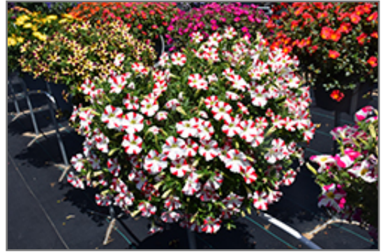
Amore King of Hearts Petunia in bloom

Amore King of Hearts Petunia will grow to be about 12 inches tall at maturity, with a spread of 14 inches. When grown in masses or used as a bedding plant, individual plants should be spaced approximately 10 inches apart. Its foliage tends to remain dense right to the ground, not requiring facer plants in front. This fast-growing annual will normally live for one full growing season, needing replacement the following year.