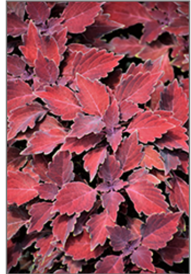
ColorBlaze Royale Cherry Brandy Coleus foliage

ColorBlaze Royale Cherry Brandy Coleus is recommended for the following landscape applications;