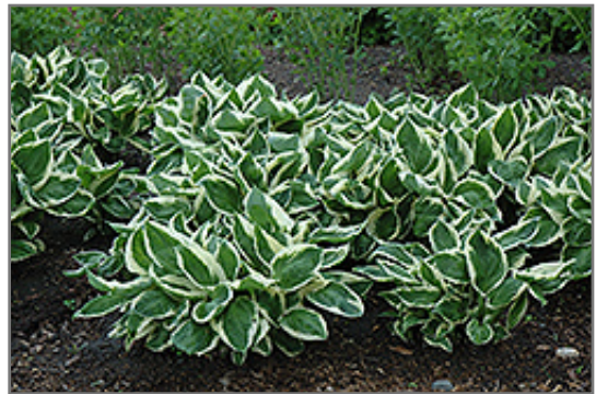
Minuteman Hosta