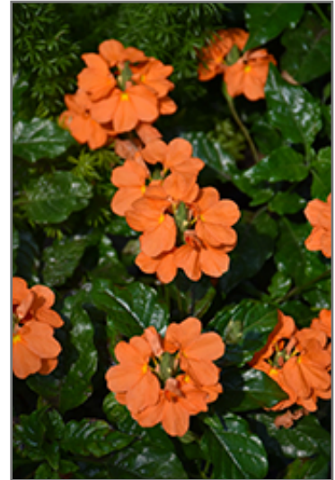
Orange Marmalade Firecracker Plant flowers

This plant does best in full sun to partial shade. It does best in average to evenly moist conditions, but will not tolerate standing water. It is not particular as to soil pH, but grows best in rich soils. It is somewhat tolerant of urban pollution. This is a selected variety of a species not originally from North America. It can be propagated by cuttings; however, as a cultivated variety, be aware that it may be subject to certain restrictions or prohibitions on propagation.