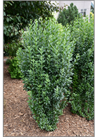
Straight Talk Privet