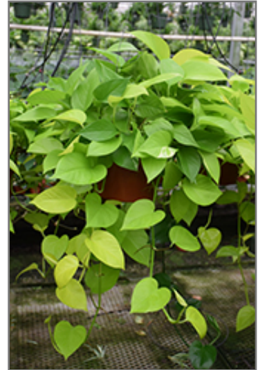
Neon Pothos in full

When grown indoors, Neon Pothos can be expected to grow to be about 5 feet tall at maturity, with a spread of 24 inches. It grows at a fast rate, and under ideal conditions can be expected to live for approximately 10 years. This houseplant performs well in both bright or indirect sunlight and strong artificial light, and can therefore be situated in almost any well-lit room or location. It does best in average to evenly moist soil, but will not tolerate standing water. The surface of the soil shouldn't be allowed to dry out completely, and so you should expect to water this plant once and possibly even twice each week. Be aware that your particular watering schedule may vary depending on its location in the room, the pot size, plant size and other conditions; if in doubt, ask one of our experts in the store for advice. It is not particular as to soil type or pH; an average potting soil should work just fine. Be warned that parts of this plant are known to be toxic to humans and animals, so special care should be exercised if growing it around children and pets.