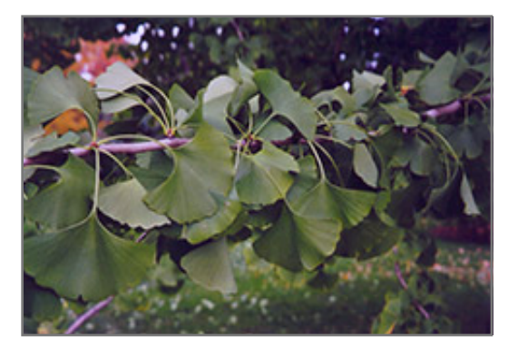
Ginkgo foliage