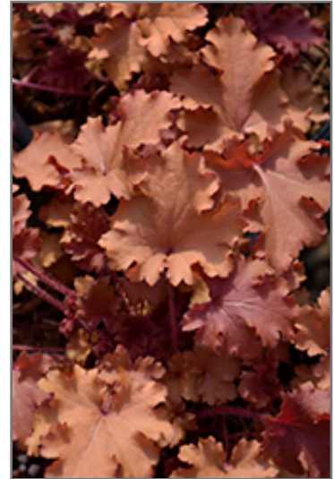
Peach Crisp Coral Bells foliage

Peach Crisp Coral Bells will grow to be about 14 inches tall at maturity extending to 20 inches tall with the flowers, with a spread of 18 inches. When grown in masses or used as a bedding plant, individual plants should be spaced approximately 15 inches apart. Its foliage tends to remain dense right to the ground, not requiring facer plants in front. It grows at a medium rate, and under ideal conditions can be expected to live for approximately 10 years. As an evergreen perennial, this plant will typically keep its form and foliage year-round.