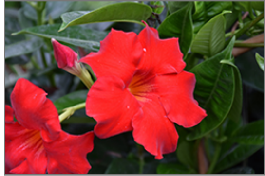
Red Mandevilla flowers

Red Mandevilla is a fine choice for the garden, but it is also a good selection for planting in outdoor pots and containers. Because of its spreading habit of growth, it is ideally suited for use as a 'spiller' in the 'spiller-thriller-filler' container combination; plant it near the edges where it can spill gracefully over the pot. It is even sizeable enough that it can be grown alone in a suitable container. Note that when growing plants in outdoor containers and baskets, they may require more frequent waterings than they would in the yard or garden. Be aware that in our climate, this plant may be too tender to survive the winter if left outdoors in a container. Contact our experts for more information on how to protect it over the winter months.