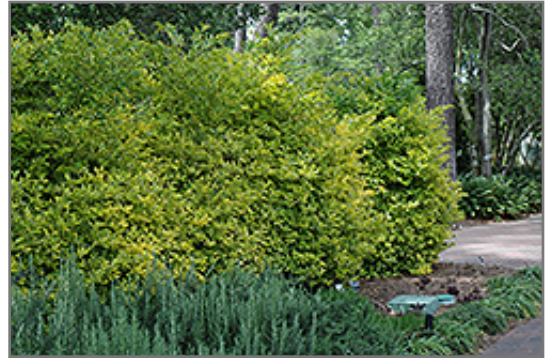
Gold Edge Duranta

Gold Edge Duranta is recommended for the following landscape applications;