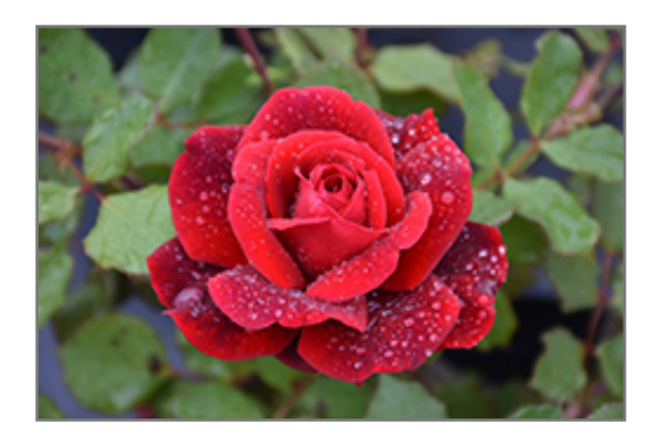
Don Juan Rose flowers

Don Juan Rose is recommended for the following landscape applications;