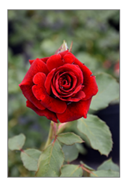
Don Juan Rose flowers

684 South Pelham Road Welland, ON L3C 3C8 905-735-5744 vermeers.ca