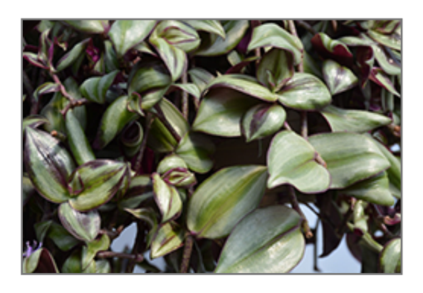
Wandering Jew foliage