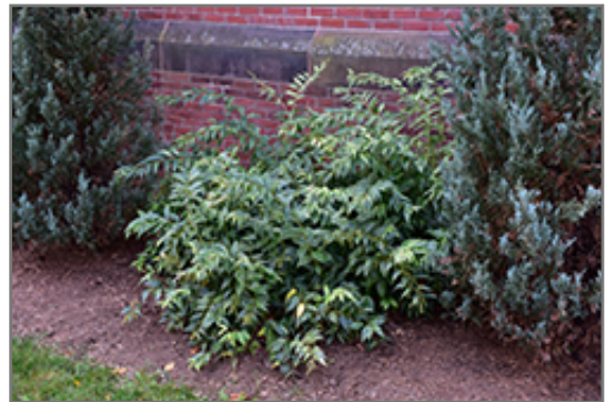
Rainbow Fetterbush