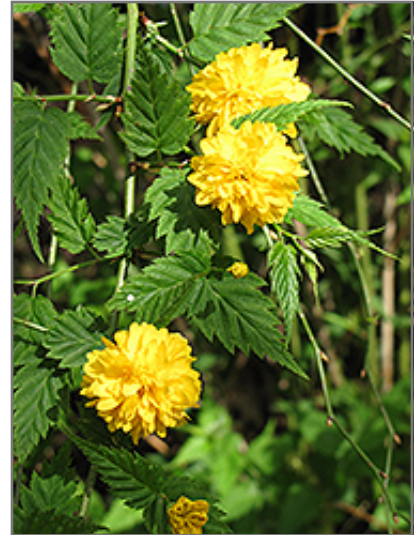
Double Flowered Japanese Kerria flowers