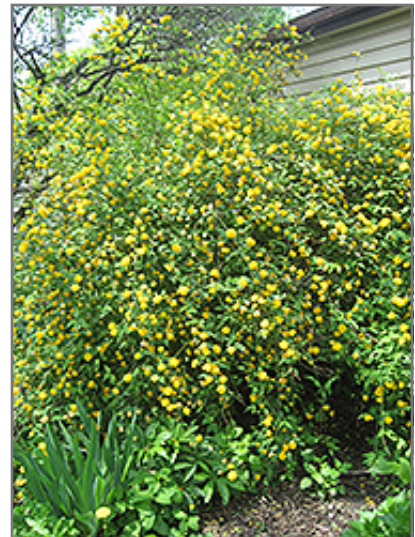
Double Flowered Japanese Kerria