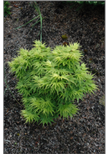
Mikawa Yatsubusa Japanese Maple

Mikawa Yatsubusa Japanese Maple is a fine choice for the yard, but it is also a good selection for planting in outdoor pots and containers. With its upright habit of growth, it is best suited for use as a 'thriller' in the 'spiller-thriller-filler' container combination; plant it near the center of the pot, surrounded by smaller plants and those that spill over the edges. It is even sizeable enough that it can be grown alone in a suitable container. Note that when grown in a container, it may not perform exactly as indicated on the tag - this is to be expected. Also note that when growing plants in outdoor containers and baskets, they may require more frequent waterings than they would in the yard or garden.