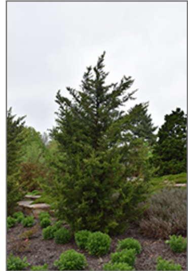
Fairview Juniper