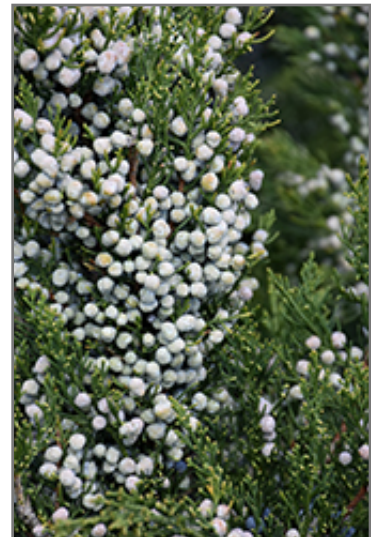
Fairview Juniper fruit