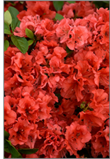
Girard's Hot Shot Azalea flowers