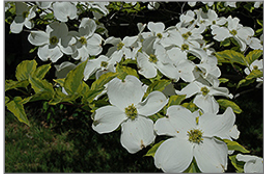
Rainbow Flowering Dogwood flowers

This is a relatively low maintenance tree, and should only be pruned after flowering to avoid removing any of the current season's flowers. It is a good choice for attracting birds to your yard. Gardeners should be aware of the following characteristic(s) that may warrant special consideration;