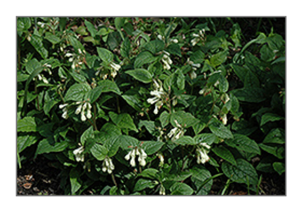
Ground Cover Comfrey flowers