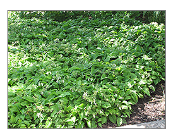
Ground Cover Comfrey in bloom