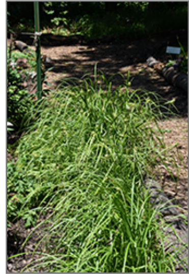
Gray's Sedge

Gray's Sedge is a fine choice for the garden, but it is also a good selection for planting in outdoor pots and containers. With its upright habit of growth, it is best suited for use as a 'thriller' in the 'spiller-thriller-filler' container combination; plant it near the center of the pot, surrounded by smaller plants and those that spill over the edges. It is even sizeable enough that it can be grown alone in a suitable container. Note that when growing plants in outdoor containers and baskets, they may require more frequent waterings than they would in the yard or garden.