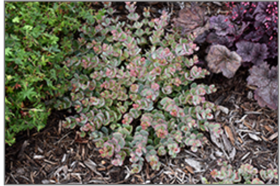
October Daphne