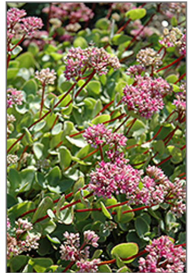
October Daphne flowers