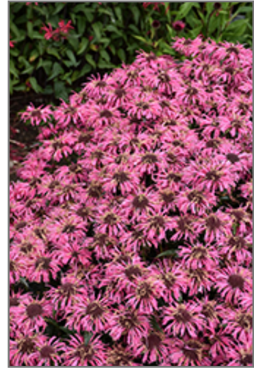
Upscale Pink Chenille Beebalm flowers

Upscale Pink Chenille Beebalm is an herbaceous perennial with a mounded form. Its medium texture blends into the garden, but can always be balanced by a couple of finer or coarser plants for an effective composition.