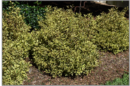
Bubbly Wine Weigela

Bubbly Wine Weigela will grow to be about 24 inches tall at maturity, with a spread of 3 feet. It tends to fill out right to the ground and therefore doesn't necessarily require facer plants in front. It grows at a medium rate, and under ideal conditions can be expected to live for approximately 30 years.