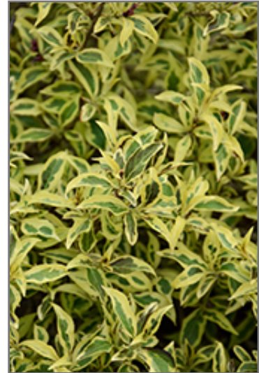
Bubbly Wine Weigela foliage

Bubbly Wine Weigela is recommended for the following landscape applications;