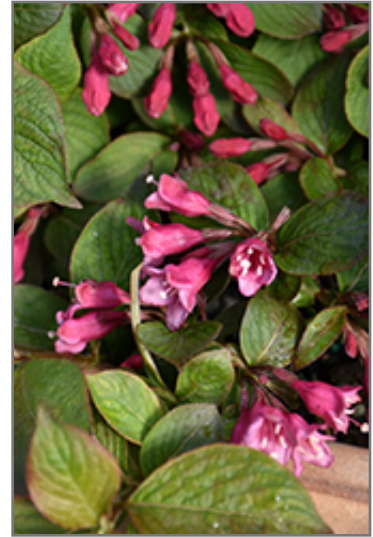
Midnight Sun Reblooming Weigela flowers

Midnight Sun Reblooming Weigela makes a fine choice for the outdoor landscape, but it is also well-suited for use in outdoor pots and containers. It is often used as a 'filler' in the 'spiller-thriller-filler' container combination, providing a mass of flowers and foliage against which the thriller plants stand out. Note that when grown in a container, it may not perform exactly as indicated on the tag - this is to be expected. Also note that when growing plants in outdoor containers and baskets, they may require more frequent waterings than they would in the yard or garden.