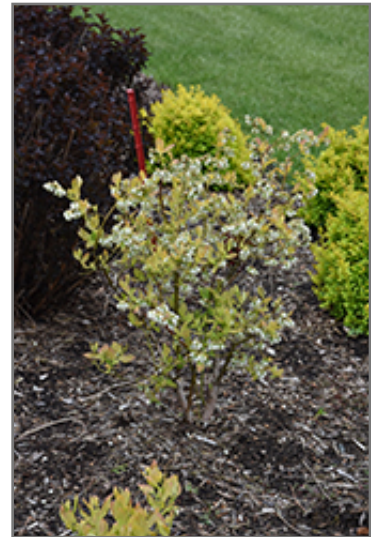
Sky Dew Gold Ornamental Blueberry in bloom

Sky Dew Gold Ornamental Blueberry is a good choice for the edible garden, but it is also well-suited for use in outdoor pots and containers. With its upright habit of growth, it is best suited for use as a 'thriller' in the 'spiller-thriller-filler' container combination; plant it near the center of the pot, surrounded by smaller plants and those that spill over the edges. It is even sizeable enough that it can be grown alone in a suitable container. Note that when grown in a container, it may not perform exactly as indicated on the tag - this is to be expected. Also note that when growing plants in outdoor containers and baskets, they may require more frequent waterings than they would in the yard or garden.