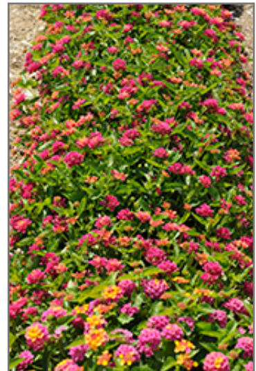
Havana Cherry Lantana in bloom