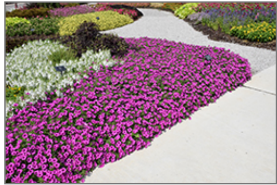
Supertunia Vista Jazzberry Petunia in bloom

Supertunia Vista Jazzberry Petunia is a fine choice for the garden, but it is also a good selection for planting in outdoor containers and hanging baskets. Because of its trailing habit of growth, it is ideally suited for use as a 'spiller' in the 'spiller-thriller-filler' container combination; plant it near the edges where it can spill gracefully over the pot. It is even sizeable enough that it can be grown alone in a suitable container. Note that when growing plants in outdoor containers and baskets, they may require more frequent waterings than they would in the yard or garden.