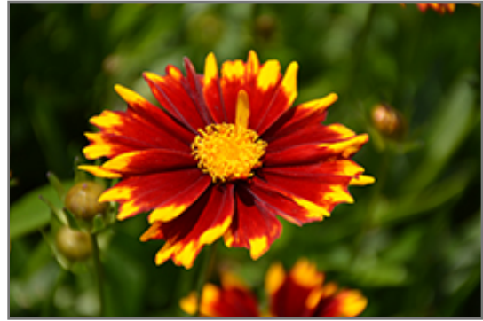
UpTick Red Tickseed flowers

UpTick Red Tickseed will grow to be about 12 inches tall at maturity, with a spread of 14 inches. Its foliage tends to remain dense right to the ground, not requiring facer plants in front. It grows at a medium rate, and under ideal conditions can be expected to live for approximately 10 years. As an herbaceous perennial, this plant will usually die back to the crown each winter, and will regrow from the base each spring. Be careful not to disturb the crown in late winter when it may not be readily seen!