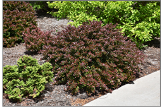
Concorde Japanese Barberry

Concorde Japanese Barberry is recommended for the following landscape applications;