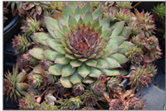
Chick Charms Butterscotch Baby Hens And Chicks

This plant will require occasional maintenance and upkeep, and should not require much pruning, except when necessary, such as to remove dieback. Deer don't particularly care for this plant and will usually leave it alone in favor of tastier treats. Gardeners should be aware of the following characteristic(s) that may warrant special consideration;