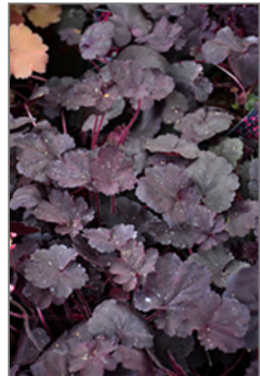
Black Forest Cake Coral Bells foliage