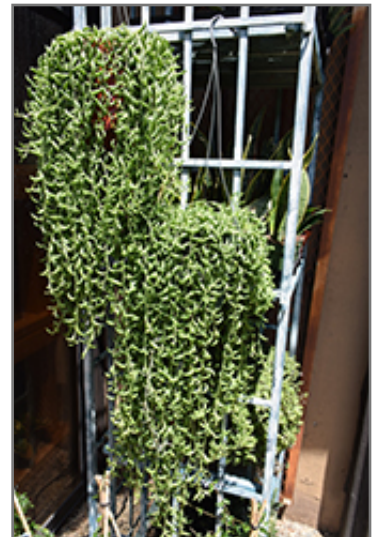
String of Bananas in full