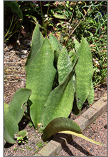
Mason's Congo

This plant does best in full sun to partial shade. It is very adaptable to both dry and moist locations, and should do just fine under typical garden conditions. It is considered to be drought-tolerant, and thus makes an ideal choice for a low-water garden or xeriscape application. It is not particular as to soil pH, but grows best in sandy soils. It is highly tolerant of urban pollution and will even thrive in inner city environments. Consider applying a thick mulch around the root zone in winter to protect it in exposed locations or colder microclimates. This species is not originally from North America. It can be propagated by division.