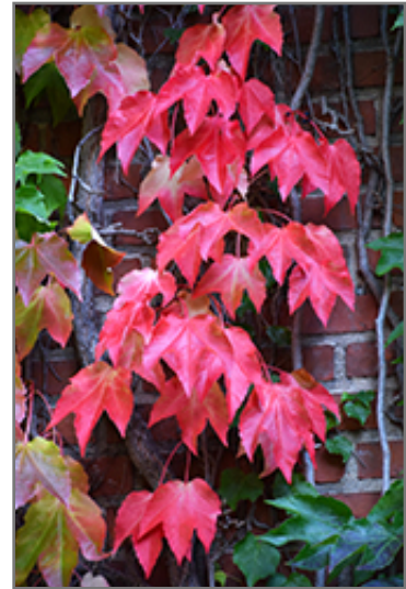
Boston Ivy in fall