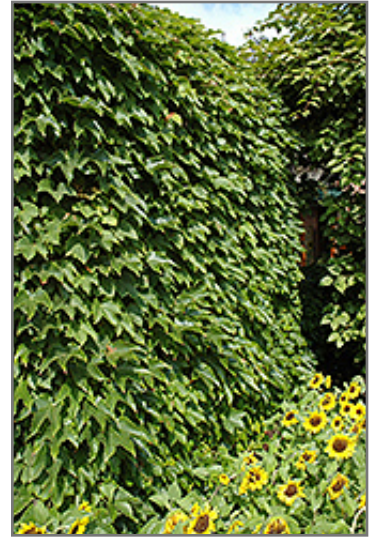
Boston Ivy

This woody vine does best in full sun to partial shade. It is very adaptable to both dry and moist locations, and should do just fine under average home landscape conditions. It is considered to be drought-tolerant, and thus makes an ideal choice for xeriscaping or the moisture-conserving landscape. It is not particular as to soil type or pH, and is able to handle environmental salt. It is highly tolerant of urban pollution and will even thrive in inner city environments. This species is not originally from North America.