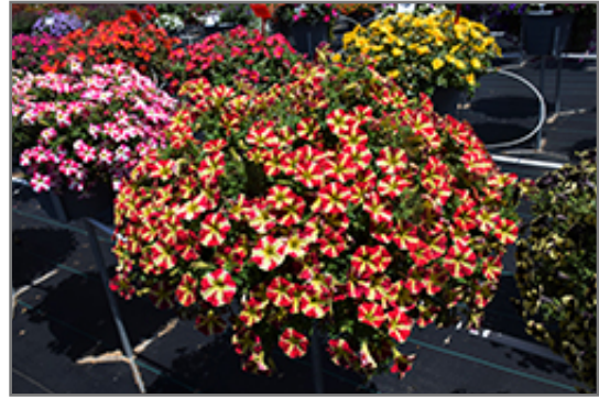
Amore Queen of Hearts Petunia in bloom

Amore Queen of Hearts Petunia will grow to be about 12 inches tall at maturity, with a spread of 14 inches. When grown in masses or used as a bedding plant, individual plants should be spaced approximately 10 inches apart. Its foliage tends to remain dense right to the ground, not requiring facer plants in front. This fast-growing annual will normally live for one full growing season, needing replacement the following year.