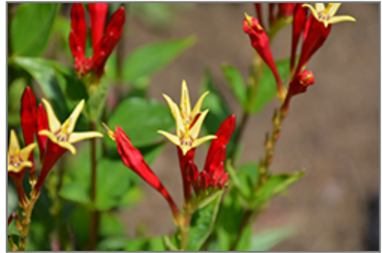
Little Redhead Indian Pink flowers