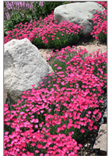
Paint The Town Magenta Pinks in bloom

Paint The Town Magenta Pinks is a fine choice for the garden, but it is also a good selection for planting in outdoor pots and containers. It is often used as a 'filler' in the 'spiller-thriller-filler' container combination, providing a mass of flowers and foliage against which the thriller plants stand out. Note that when growing plants in outdoor containers and baskets, they may require more frequent waterings than they would in the yard or garden.