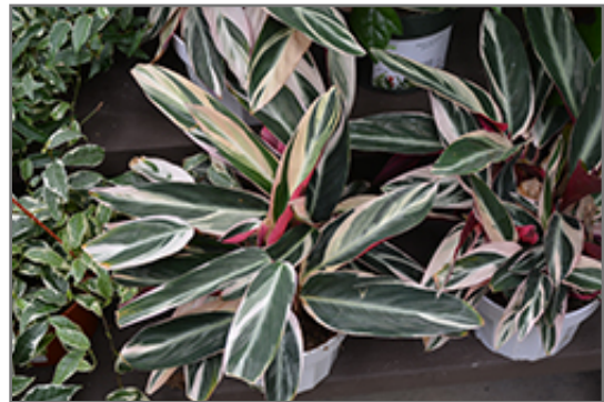
Triostar Stromanthe in full