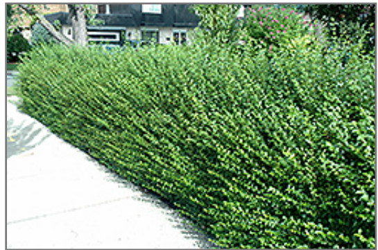
Amur Privet