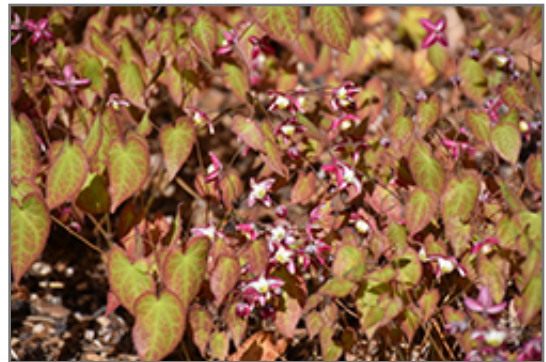
Bishop's Hat in bloom