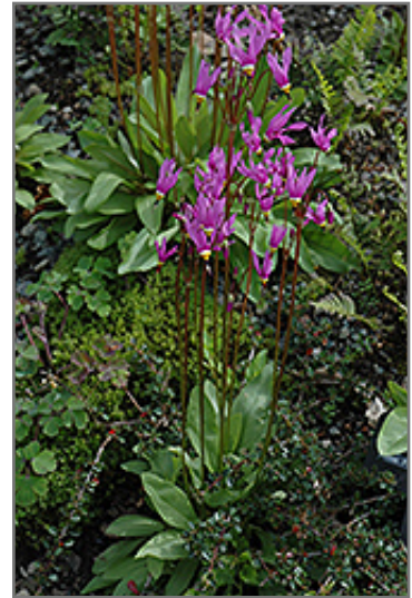
Shooting Star in bloom