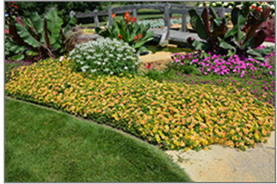
Supertunia Honey Petunia in bloom

Supertunia Honey Petunia will grow to be about 10 inches tall at maturity, with a spread of 24 inches. When grown in masses or used as a bedding plant, individual plants should be spaced approximately 20 inches apart. Its foliage tends to remain low and dense right to the ground. This fast-growing annual will normally live for one full growing season, needing replacement the following year.